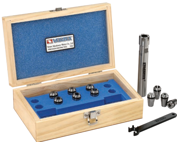
MINI TYPE NUT