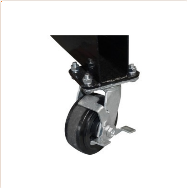
Swivel castors with parking brake