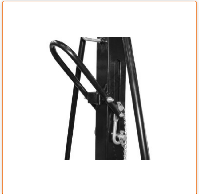
Safe and easy height adjustment in unloaded state via levers and two safety bolts per support carrier