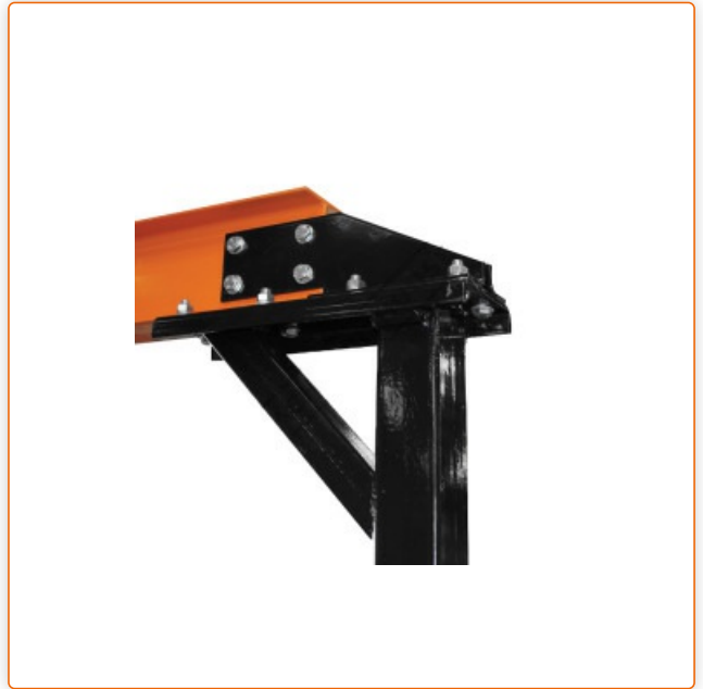
Stable design of the carrier supports