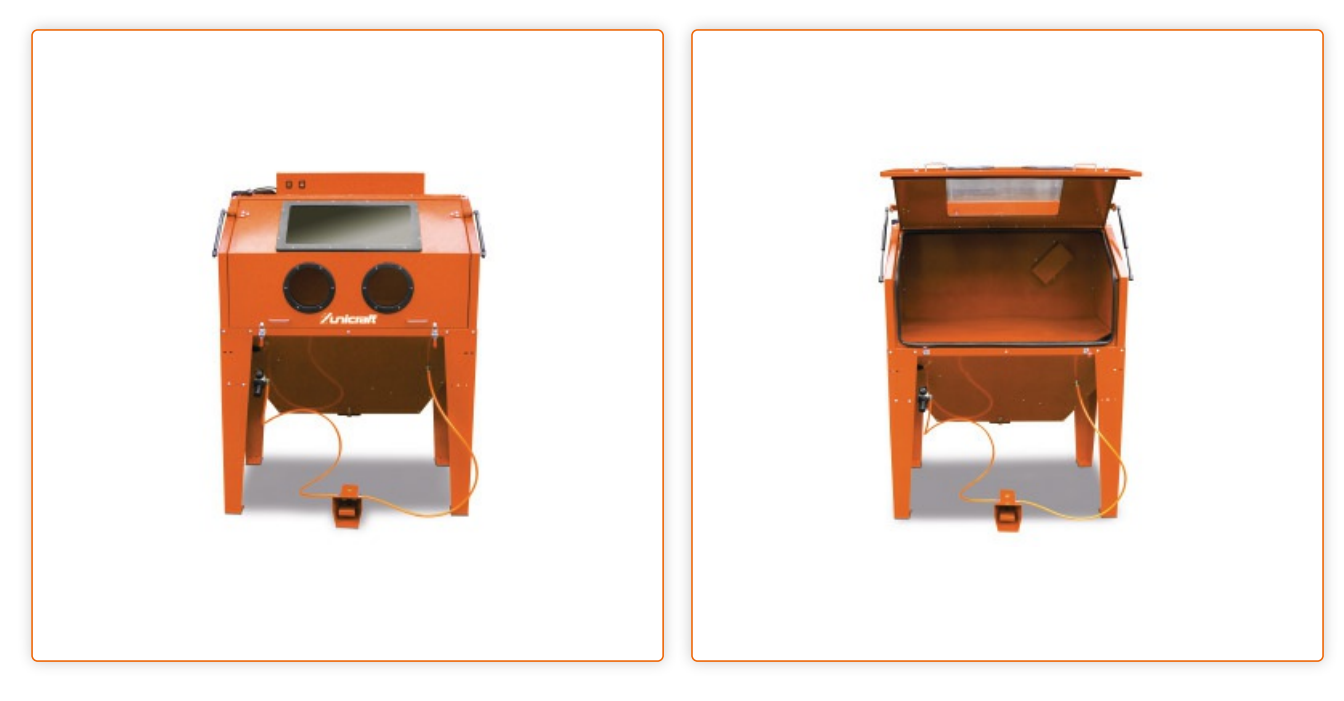
Fig. shows SSK 3.1 featuring a very large front flap which opens upward