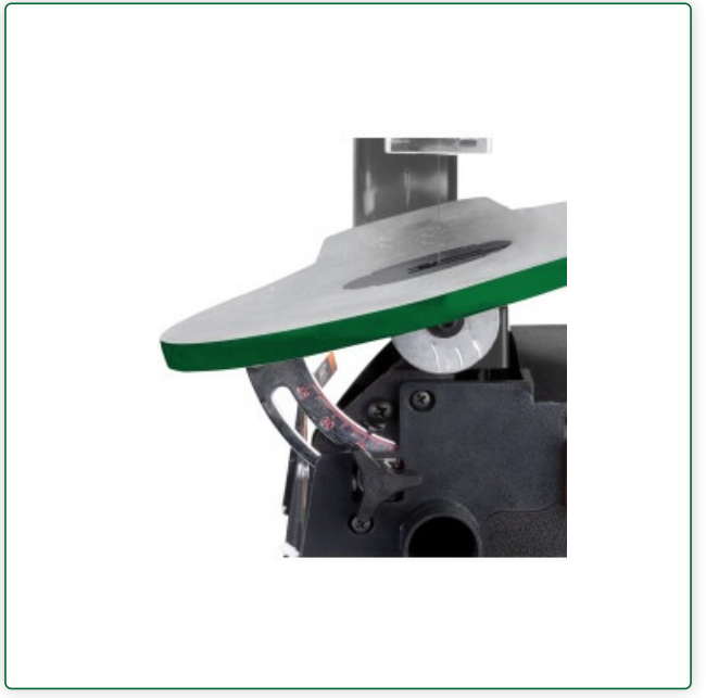
Air blowing unit removes coarse saw dust from the cutting area