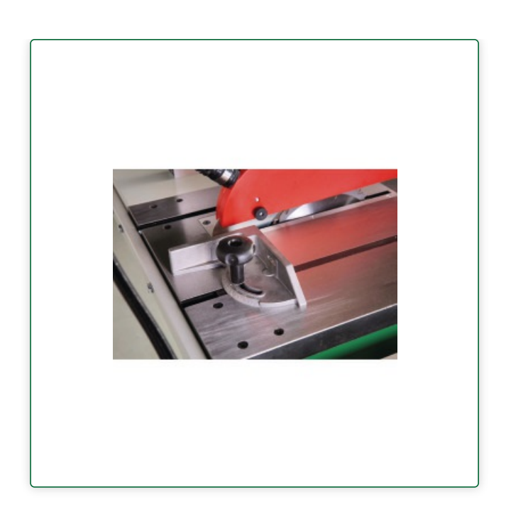
Angle stop included