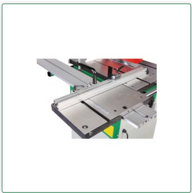
Saw blade pivoting from 90 ° to -45 ° to the left