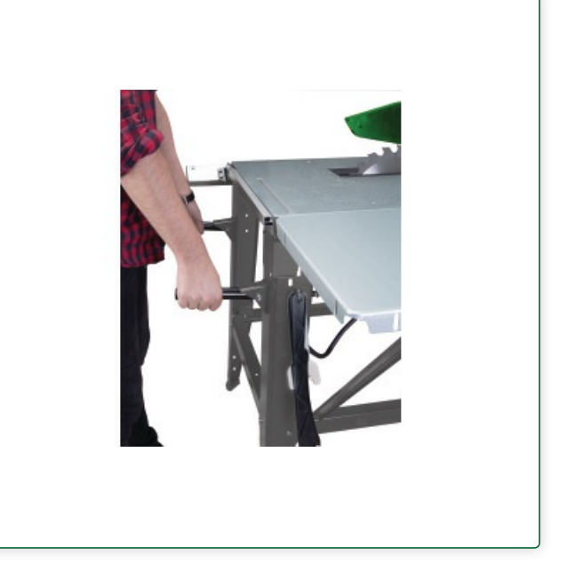
Conveniently movable by chassis and folding transport handles