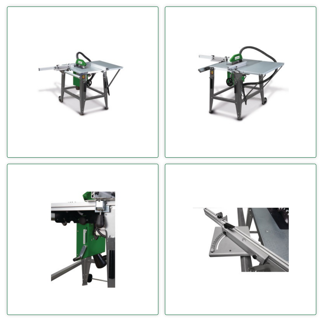
Simple manual height adjustment of the saw unit via hand crank, tilt adjustment from 0 – 45 ^\circ