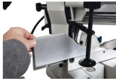
Locking device for limiting the crosscut depth