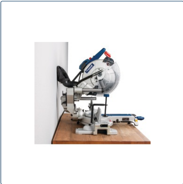
Space saving design