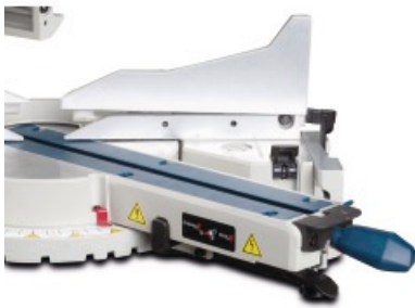
Convenient adjustment of miter and head tilt directly from the front of the table