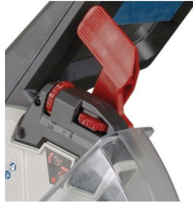
Standard with laser