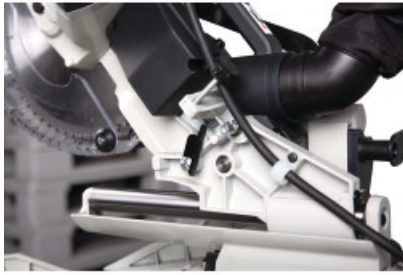
Locking device for limiting the crosscut depth