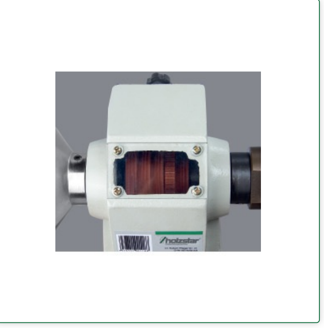
Control of the selected speed through inspection window on the V-belt pulley, simple folding of the Vbelt over the tension lever