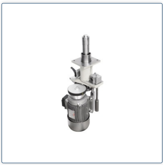
Cast iron milling unit