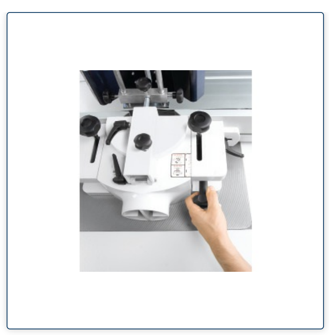
Exact milling stop

With quick adjustment and fine adjustment with scale on the stop jaw